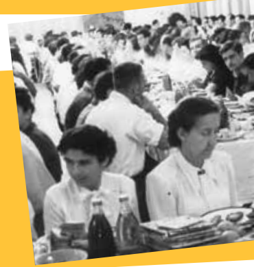
APRIL 1948 GAN-SHMUEL PASSOVER

been living in this beautiful country for more than thirty years. For me, Passover will always be a holiday of hope and faith.