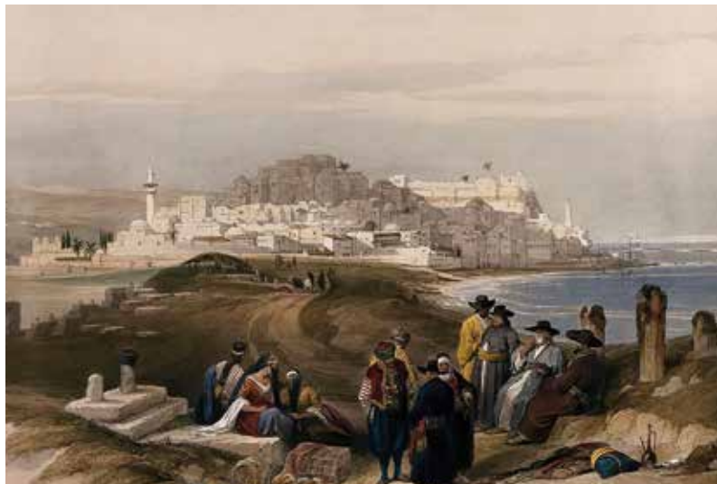
Jaffa, looking south. Colored lithograph by Louis Haghe after David Roberts, 1843.

The second mention of Joppa is in the book of Jonah. When the prophet fled from his mission to offer the nation’s enemies a chance to repent, he ran to this port city. There, he found a ship traveling to the furthest known reaches of civilization, Tarshish. It is still possible to find a ship at the Jaffa port today, since it is one of the oldest ancient port cities still operating continuously on the Mediterranean. Joppa remained the area’s main port until 1938 when the Tel Aviv port replaced it. Later, modern deep-sea ports replaced the Tel Aviv port. The last two biblical references to Joppa mention its port as the transit point for supplies for building Solomon’s Temple and then rebuilding the Temple during the time of Ezra (2 Chronicles 2:16; Ezra 3:7). The ancient city of