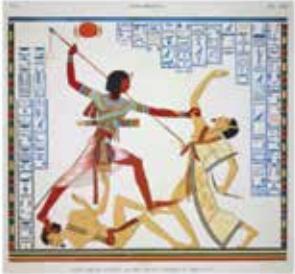
THE MESSAGE OF THE PASSOVER NARRATIVE