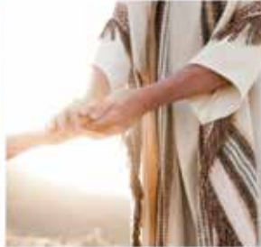
THE MESSIAH OF THE PASSOVER PROMISES

If you have not, then why not do something especially meaningful this coming spring? Simply invite a Chosen People Ministries missionary to come share this powerful message to bless you and your church family! When you do, you will understand why one pastor recently said,