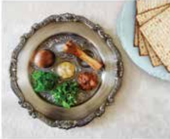
THE MEANING OF THE PASSOVER ELEMENTS