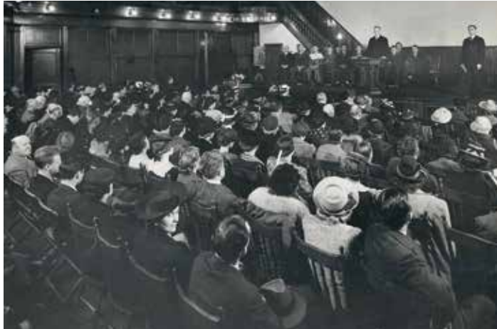
Making the church aware of the Holocaust in 1945.

Hitler murdered at least six million Jewish people, but never completed the job he started, as God would not...and could not...allow it!