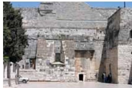
The Church of the Nativity

As part of our ministry to the Jewish people we serve we will hold a special Hanukkah outreach celebration. In that